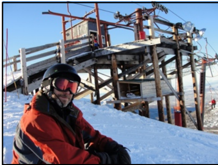
Top: A busy day at the lodge!